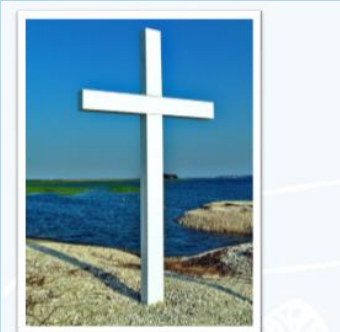
The cross stands for Jesus' death because he died on a cross.