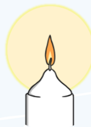
The candle flame is another symbol as Jesus is known as the light of the world to Christians. It is seen as a symbol of hope in dark times.

I recognise some symbols of belonging for Jewish people: