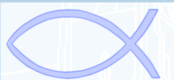
The fish was a secret sign used by people who weren't allowed to be Christians. This symbol secretly showed that a person believed in and followed Jesus. Today, you might still see it!