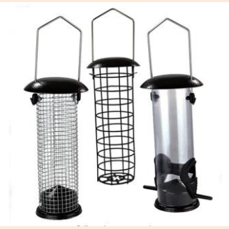
From St Cuthbert's Eco Ambassadors

We recently took part in the RSPB's birdwatch and we disappointed to find that there weren't many birds visiting our school grounds. We would like to put up lots of bird feeders around the school. If anybody has any bird feeders or bird food that they would like to donate, we would happily put them to good use. Thank you.