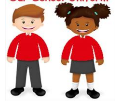
Our School Uniform

Please support our school uniform policy by sending children to school in the correct uniform, as soon as possible. Thank you.