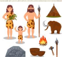
A Stone Age family.